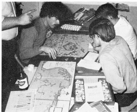
Stalwarts of the IGB abandon Afrika Korps and Anzio in favor of new game, Panzerblitz — the latter game among those donated by AH for door prizes.

reached. The sponsoring group is known only too well to subscribers of this magazine. For those who are new to it all, we need only to call your attention to the Vol. 7, No. 2 back issue which